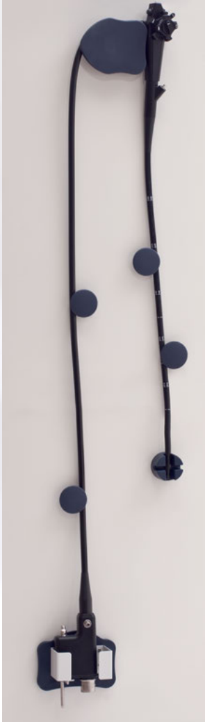
Magnetic endoscope holder (EBS 8-C.51)