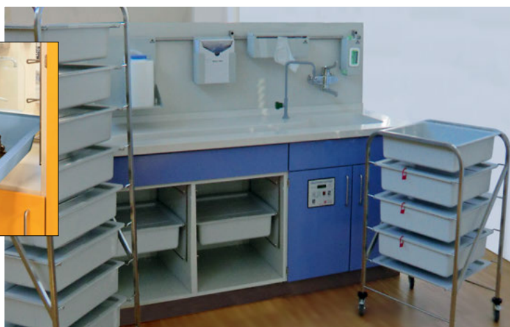
Cleaning-table system with Becker endoscope sink, dosing device and hygiene rail