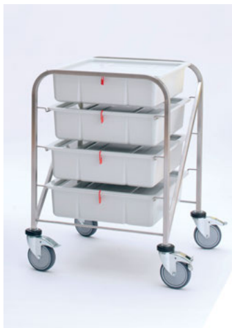
131152 with Endoboxes/ lids/seals